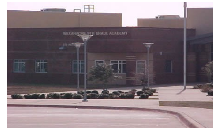
Ninth Grade Academy 275 Indian Drive

Please, however, do not plan to park there. Parking is extremely limited and fire lanes are strictly enforced.