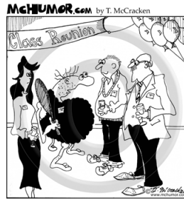
"I went into hunting and gathering. And you?"