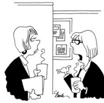
"I went to my high school reunion over the weekend. Some of my classmates changed so much that they didn't even recognize me."