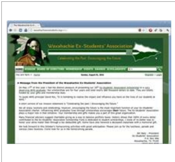
Please visit the official WHS Ex-Students' website: www.waxahachieexstudents.org